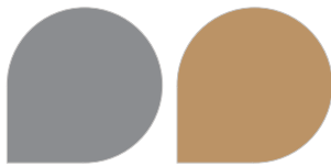
SMOKE GRAY Letterpress C