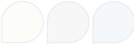
RECYCLED BRIGHT WHITE Wove 30% pcw W CB P